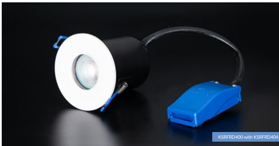
KSRFRD400 with KSRFRD404